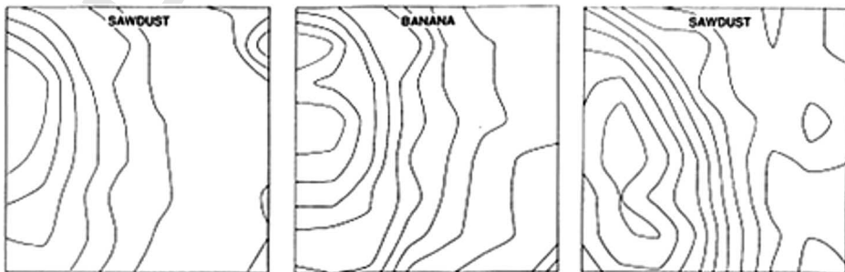
Figure 2. Dynamic contour plots of odorant stimuli.

The contour plot at the left emerged consistently from bulbar EEGs of a rabbit that had been conditioned to associate the scent of sawdust with a particular reinforcement. After the animal learned to recognize the smell of banana (middle), reexposure to sawdust led to the emergence of a new sawdust plot. The amplitude modulation pattern of the reexposure to sawdust was different from the first, as it was changed by the intervening experience. We concluded that every new meaningful experience alters all others, and there are no fixed stores or representations. Bartlett (1932) was prescient in stating, "Some widely held views [of memory] have to be completely discarded, and none more completely than that which treats recall as the reexcitement in some way of fixed and changeless 'traces'" (p. vi). Even at the level of unimodal perception, we observe change in perception as a function of experience. Often, it is assumed that it is only at the global, multimodal organization of a self that this level of modification occurs, but as we see, it occurs at the most basic of levels. Freeman (2000) concluded